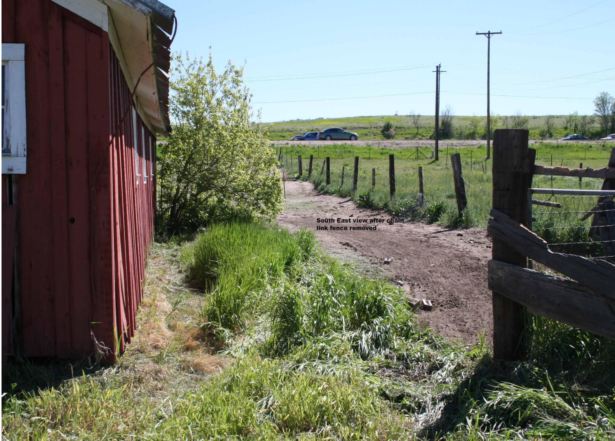
South East view after chain link fence removed.