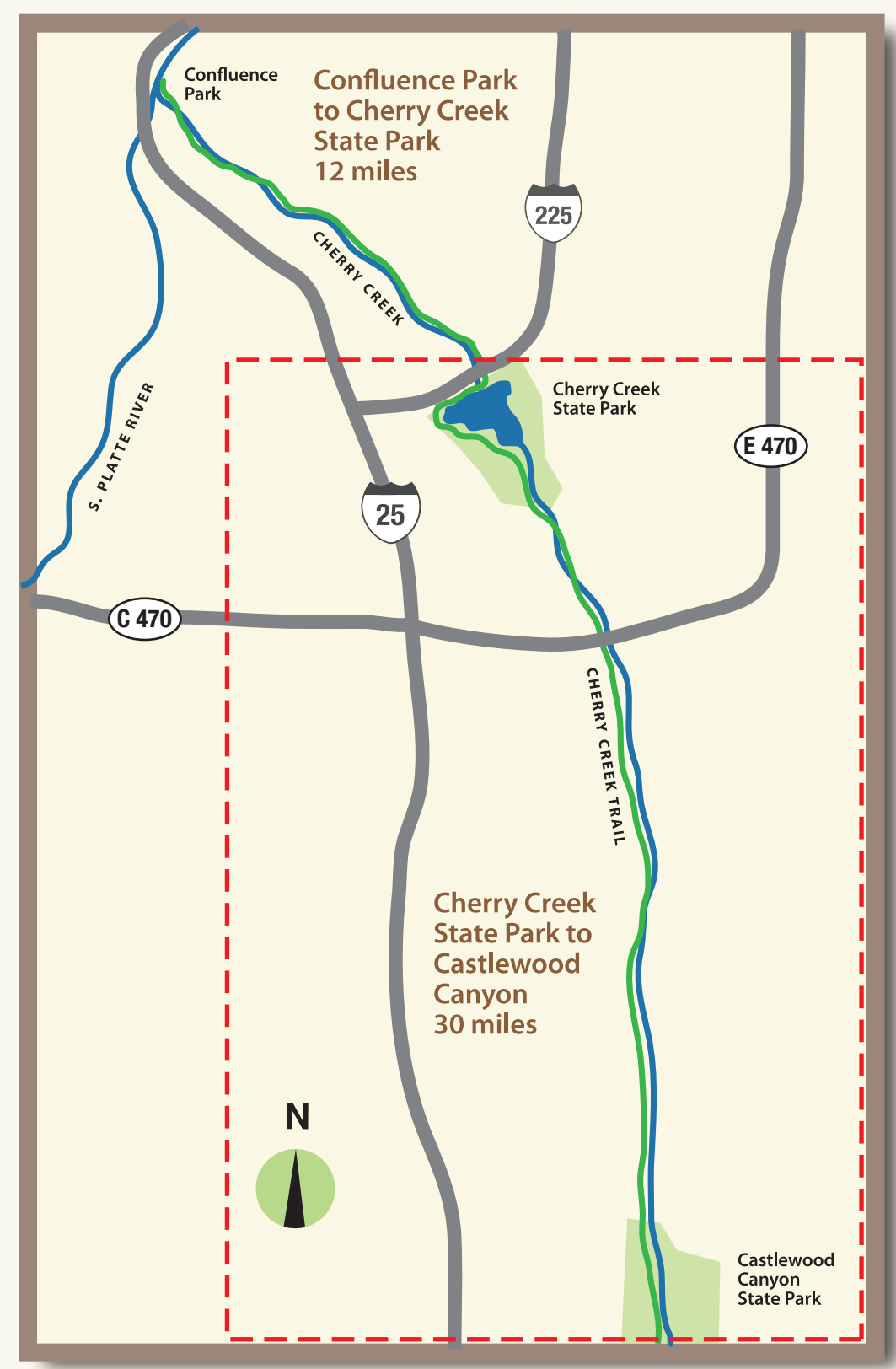
Confluence Park to Castlewood Canyon State Park 42 miles

To report an emergency call 911 To report unsafe conditions or maintenance issues call 303-222-3456