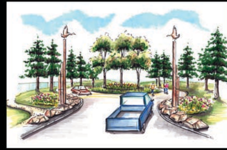
ENTRY MONUMENT PERSPECTIVE nts