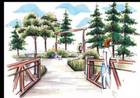
PEDESTRIAN BRIDGE PERSPECTIVE nts