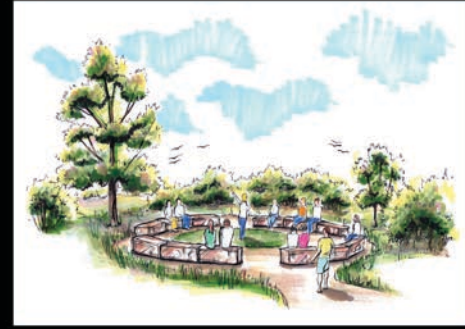
GATHERING COUNCIL RING PERSPECTIVE nts