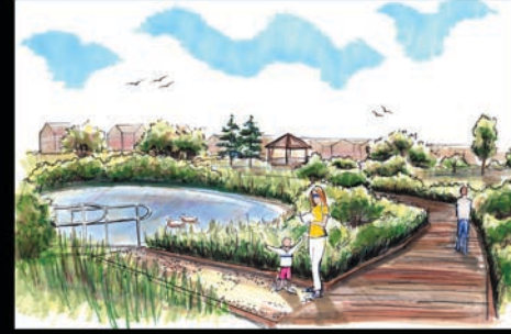
CREEK SIDE BOARDWALK PERSPECTIVE nts