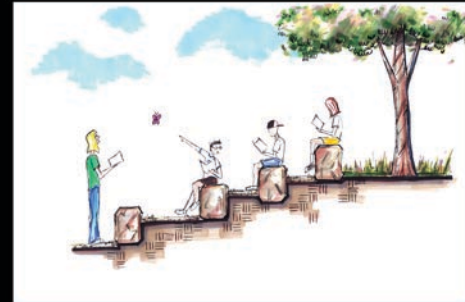
CREEK SIDE OUTDOOR CLASSROOM SECTION nts